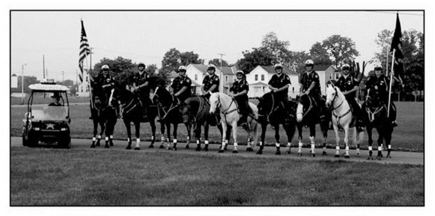
We Support the Butler County Fair

In addition to the function of crowd control, the Mounted Patrol Unit is also used during searches when someone flees from a crime scene or when an inmate or criminal escapes custody. They are also used for security purposes at major events, such as the Butler County Fair. Additionally, they are present at a large number of parades and other public appearances.