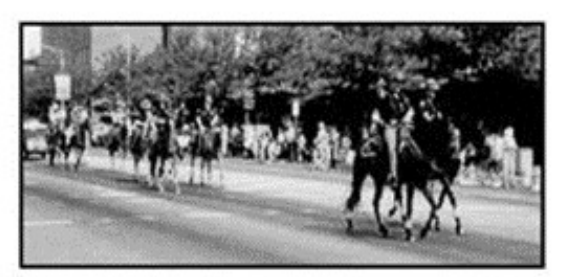
Mounted Patrol is always a parade favorite.

Members of the Butler County Sheriff's Mounted Patrol are primarily "Honorary Special Deputies" serving entirely as volunteers. These Deputies must meet the same qualifications as any other employees of the Butler County Sheriff's Office. They must pass a thorough criminal background check, financial background check, drug screen and also a horsemanship test, before being placed on the Mounted Patrol.